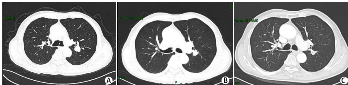
Figure 1. Chest direct enhanced CT images. A: Contrast-enhanced CT scan showed an irregular lobulated mass in the posterior segment of the upper lobe tip of the left lung; 2023-01-28 chest enhanced CT showed that the lesion size was about 30 mm × 29 mm × 34 mm; B: After 3 cycles of treatment, chest enhanced CT was reexamined on 2023-03-26, and the lesions were smaller than before, with a size of about 20 mm × 15 mm × 27 mm; C: After 5 cycles of treatment, chest enhanced CT was reexamined on 2023-06-17, and the lesions were smaller than before, and the current size was about 19 mm × 10 mm × 23 mm

入院后，完善相关检查，肺癌相关的肿瘤标记物血清学检测提示：细胞角蛋白 19 片段(CYFRA 21-1): 4.030 ng/ml (0~3.3 ng/ml)，鳞状上皮细胞癌相关抗原(SCCAg) 1.6 ng/ml (0~1.5 ng/ml)，余实验室检测结果(如血常规、电解质、肝功、肾功、凝血常规等)未见明显异常；胸部增强 CT：可见左肺上叶尖后段见一不规则形分叶状肿块，大小约 30 mm × 29 mm × 34 mm，边缘欠规整，强化后可见肿物不均轻度强化(图 1A)，考虑：左肺上叶尖后段占位性病变；倾向于恶性肿瘤性病变。排除禁忌后行超声引导右上臂肿物穿刺活检术，病理回示：纤维结缔组织中查见低分化腺癌；免疫组化：肿瘤细胞 CK、CAM 5.2、Syn(+), TTF-1(少量+), P63、NapsinA、CD56、NSE、CgA(-), Ki-67(+, 8%~10%)(图 2A)。并行支气管镜检查，镜下可见左肺上叶后段支气管开口处新生物沿管壁浸润性生长，活检病理示：送检组织中查见异型细胞巢，结合免疫组化符合低分化癌，倾向低分化腺癌；免疫组化：CK(+), p40(个别+), CK5/6(局灶+), TTF-1(局灶+), NapsinA(-), CK7(-), Ki-67(+, 60%)(图 2B)。行颅脑 MRI 增强扫描、全身骨显像(ECT)、上腹部增强 CT 浅表淋巴结彩超检查进行全身评估未见明显肺癌转移征象。基因检测 EGFR、ALK、KRAS、BRAF 和 MET 等未见基因突变。分子检测程序性死亡配体-1 (PD-L1)检测结果：TPS < 1%。患者最终诊断左肺腺癌(T2N0M1 IV 期)、右臂转移癌。