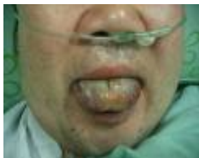
Figure 23. 4 hours later tongue tip restores the blood follow 图 23. 4 小时后病患舌尖先恢复血液循环颜色