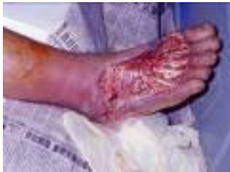
Figure 12. After surgical debridement to remove the patient dorsum pedis necrotic tissue 图 12. 足背组织肿胀坏死，经扩创处理，清除坏死组织