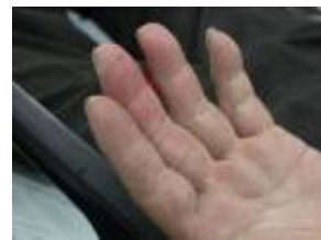
Figure 41. The red adhesive tape detachment, the middle finger restores the blood follow and non-venom response symptom