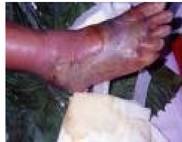
Figure 16. The patient dorsum pedis swelling necrosis bitten by Naja naja atra 图 16. 被饭匙倩咬伤足背，足背组织肿胀坏死