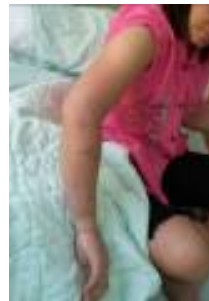
Figure 5. Swelling forearm bitten by Trimeresurus stejnegeri 图 5. 被赤尾鲀咬伤员者前臂肿胀