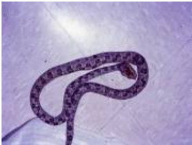
Figure 6. Trimeresurus mucrosquamatus bites the Fig 7 patient 图 6. 咬伤员者被抓到之龟壳花

百步蛇身体两侧各有一列倒三角形具黑边深棕色斑纹排列, 头大呈三角形, 嘴尖向上翘, 头状似鼷头, 故又名山谷鼷, 体长约 95 公分, 体重约 500~1200 公克是台湾地区毒蛇中体形最大的一种, 具有中度的攻击性, 因数量急速减少被列为保育的野生动物, 有颊窝, 口内有一对大管牙, 可长达 3~4 公分, 属出血性毒, 毒性物质有 ADPase、5'-nucleotidase、phospholipase A2 及 fibrinogenase, 其中 ADP ase 具有明显抑制血小板凝集功能, 导致出血倾向。咬伤后患处肿痛、瘀血、起血泡, 症状和赤尾鲀、龟壳花等出血性毒蛇相似, 唯一不同是血小板会明显减少, 可资区别, 故治疗除给予抗蛇毒血清外尚需补充血小板, 百步蛇咬伤以前是台湾毒蛇咬伤致死率最高的一种, 但由于抗蛇毒血清的发达及血小板制剂的补充, 致死率已大大地降低 [23,28,29] 。(图 8~9)