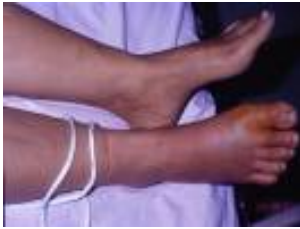
Figure 39. The site bitten by the poisonous snake not to be suitable to use the tourniquet, avoids misinterpreting to be the venom create swelling or the tourniquet create swelling, confuses whether to give antivenom treatment or not

图 39. 被毒蛇咬伤部位不宜用止血带, 以避免误判是毒液造成肿胀或止血带造成肿胀, 增加是否给予抗蛇毒血清治疗之困扰