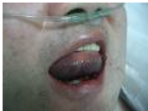
Figure 21. 2 hours later, nearly the whole tongue swelling, ecchymosis and myonecrosis. 图 21. 2 小时后舌底及舌尖皆呈泛黑坏死状