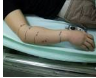
Figure 3. Swelling forearm bitten by Trimeresurus stejnegeri 图 3. 被赤尾鲀咬伤员者前臂肿胀