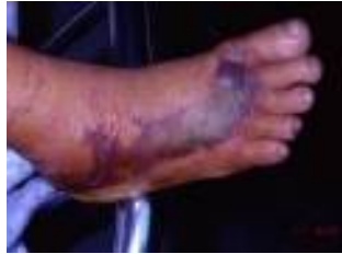
Figure 11. The patient dorsum pedis swelling necrosis bitten by Naja naja atra 图 11. 被饭匙倩咬伤足背，足背组织肿胀坏死