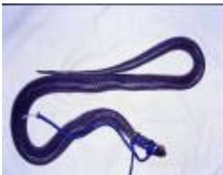
Figure 14. Naja naja atra bites the Figure 15 patient 图 14. 咬伤病患被打死的饭匙倩

台湾东部被眼镜蛇咬伤其抗蛇毒血清亦需加倍给予 [4,23,31-34]。(图 10~30)