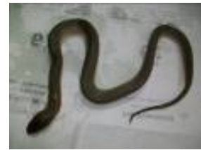
Figure 26. Unknown small snake to bite the Fig19 patient is caught 图 26. 咬伤病患足背被抓到之不知名小蛇