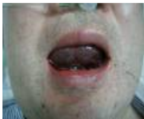
Figure 22. 2 hours later, the whole tongue swelling, ecchymosis and myonecrosis, tongue excision is considered. 图 22. 2 小时后, 整个舌头皆呈现泛黑坏死状