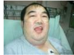
Figure 25. Good viability and mobility after quick antivenom treatment. and good blood supply of tongue 图 25. 2 小时后病患整个舌头都恢复原状, 病患复原迅速, 应归功于尽早给予足量的抗蛇毒血清及舌头血液丰富所致