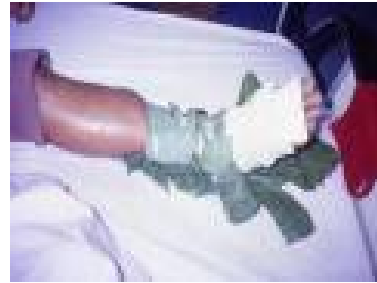
Figure 15. Inappropriate herb drug treatment for snakebite wound to increase the wound infection risks 图 15. 被图 14 饭匙倩咬伤足背，用中草药治疗徒增伤口感染的风险

台湾东部被眼镜蛇咬伤其抗蛇毒血清亦需加倍给予 [4,23,31-34]。(图 10~30)