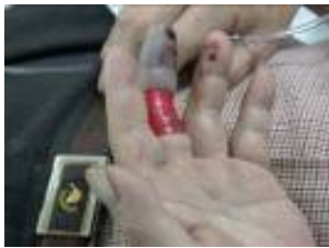
Figure 40. The middle finger bitten by the snake, with the red adhesive tape bundle middle finger, cyanosis is noted

图 39. 被毒蛇咬伤部位不宜用止血带, 以避免误判是毒液造成肿胀或止血带造成肿胀, 增加是否给予抗蛇毒血清治疗之困扰