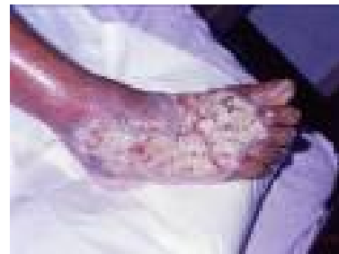
Figure 17. The patient receive split-thickness skin grafts surgery 图 17. 足背坏死组织经扩创及植皮手术治疗