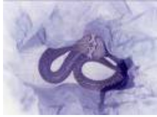
Figure 10. Naja naja atra bites the Figure 11 patient 图 10. 咬伤病患被活抓的饭匙倩