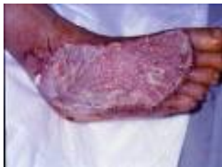
Figure 13. The patient receive split-thickness skin grafts surgery 图 13. 足背坏死组织经扩创处理，再施以分层植皮手术