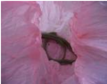
Figure 1. Trimeresurus stejnegeri bites the Figure 2 patient 图 1. 咬伤员者被抓到之赤尾鲀

赤尾鲀因其身体绿色，尾巴红色，故又名赤尾青竹丝、竹仔蛇，若尾巴是绿色，则为无毒的青蛇，两者的区别在于是否有“赤尾”。赤尾鲀头呈三角形，有颊窝，颊窝为介于眼与鼻之间的凹窝，左右各一，内有血管与三叉神经分布，是温度探测器，可供侧周遭环境细微温度的改变，藉以搜寻小型哺乳类动物身上的体温并加以捕食，口内有一对大管牙，体长约 50 公分，咬伤后有明显毒牙痕，体色极具掩护作用属树上蛇，为出血性毒，作用机转仍不明，主要毒素成份有出血成份(Hemorrhagic factors HR1 和 HR2)、凝血成份 (platelet aggregoserpentin)、抗凝血成份 (platelet aggregation inhibitor, 5’-核甘酸分解酵素)，高浓度呈现促凝血作用(似 Thrombin 作用)，低浓度则具溶血作用，分布于中国大陆东南部及台湾，遇到目标会凶猛的攻击，被咬伤后患处肿痛、出血、起水泡，在台湾为分布最广的毒蛇，数量最多且是咬伤率最高的一种，但因其毒液量少，致死率低 [23-25] 。(图 1~5)