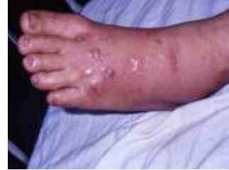
Figure 4. Swelling blister foot bitten by Trimeresurus stejnegeri 图 4. 被赤尾鲀咬伤员者足背肿胀起水泡