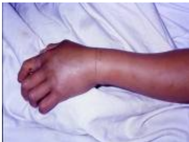
Figure 7. Swelling forearm bitten by Trimeresurus stejnegeri 图 7. 被图 6 龟壳花咬伤员者前臂肿胀