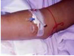
Figure 38. The same side bitten by the poisonous snake not suitable intravenous injection treatment avoids worsening the tissue swelling