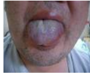
Figure 24. 2 hours later. all the tongue circulation restores. 图 24. 2 小时后病患舌头大部份恢复血液循环颜色