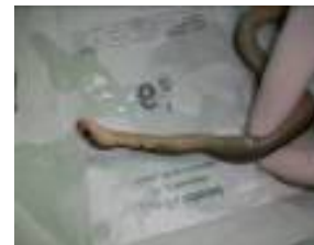
Figure 27. Emergency room nurse plays tricks on the small snake startled anger upper body erectness by the bamboo stick, the small snake is Naja naja atra 图 27. 急诊室护士以竹棒戏弄小蛇惊怒上身直立, 颈部变扁平始知饭匙倩