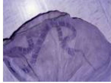
Figure 31. Bungarus multicinctus bites the Figure 32 patient right middle finger 图 31. 咬伤病患右手中指被抓到之雨伞节

雨伞节因全身有黑宽白窄相间的横带, 故又名 为百节蛇 , 该蛇喜栖水边, 性温顺, 属夜行性蛇, 头小而圆不呈三角形, 无颊窝, 口内有一对大沟牙, 二对小沟牙, 分布于缅甸、中国大陆南部及台湾, 属神经毒( Bungarotoxins ), 作用于神经肌肉接合处, 进而阻断神经传导使得横纹肌不收缩, 导致呼吸麻痹, 因此当病患出现眼睑下垂(Ptosis)或胸闷时, 应尽快给予抗蛇毒血清并考虑插管使用呼吸器维持呼吸, 雨伞节咬伤后, 伤口并无明显肿痛症状, 故常让患者忽略而未就医, 待觉得昏昏欲睡时, 常在 30 分至 2 小时内即演变成致命的呼吸衰竭, 目前是台湾毒蛇咬伤死亡率最高的, 可高达 24%, 因此若被雨伞节咬伤, 应尽快送医观察治疗, 若有呼吸衰竭现象则尽快插管使用呼吸器并给予抗蛇毒血清, 常可化险为夷, 挽回一命 [23,35,36] 。(图 31~35)