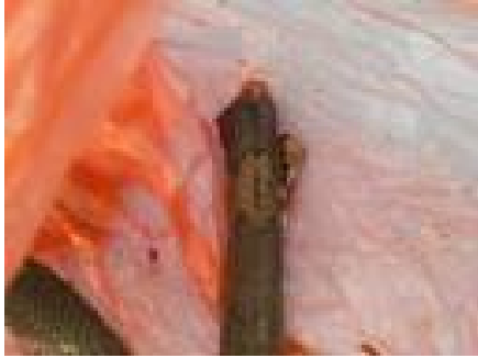
Figure 29. The snake to bite the Fig19 patient is caught and be-headed immediately, the snake is known as Naja naja atra by back black and white concentric pattern 图 29. 咬伤病患右手被抓到迅即被砍头处决之蛇, 由背部黑白环纹得知是饭匙倩