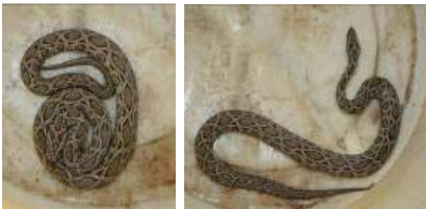
Figure 36. Vipera russelli formosensis 图 36. 台湾的锁链蛇

锁链蛇体背有三纵列锁链状(非龟壳状)斑纹, 故称为锁蛇或锁链蛇, 常被误认为龟壳花, 头呈三角形无颊窝, 常见于台湾东南部山区、广东、印度喜马拉雅山, 性情凶猛, 常在夜间活动, 具攻击性, 会如眼镜蛇般发出嘶嘶的喷气声, 其毒素有出血性及神经性两种混合毒素, 毒素甚为复杂, 有 pro-coagulation factors V 和 X actinators, protease inhibitor 及 phospholipase A2, 会引起凝血反应, 耗损其他凝血因子形成血栓, 阻塞血管, 导致多发性血栓血管阻塞病变, 引起全身扩散性血管内凝血病变(DIC)。咬伤后局部肿胀轻微, 主要以出血及溶血症状为主, 皮下多处瘀血及紫斑, 并常导致急性肾衰竭及血小板减少, 尽早给予锁链蛇抗蛇毒血清 2~4 剂治疗可有效改善凝血机能障碍, 但对肾功能伤害改善有限, 常需进行血液透析治疗 [37-40] 。(图 36~37)